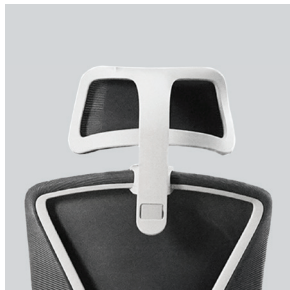
Adjustable Headrest Adjustable headrest up to 45mm range.