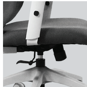
Multi Locking System Three locking position & chair base adjustment range 0-100mm.