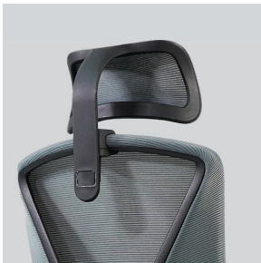
Adjustable Headrest Adjustable headrest up to 45mm range.