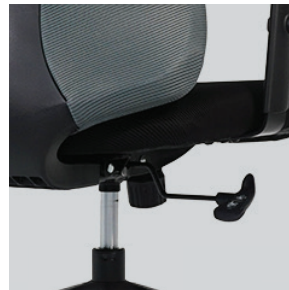
Multi Locking System Three locking position & chair base adjustment range 0-100mm.