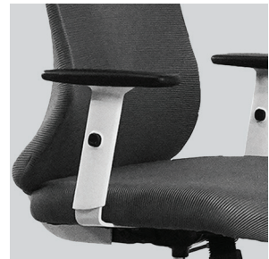
Adjustable armrest 2D adjustable up and down armrest.