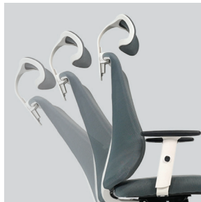
Adjustable backrest 20° backrest tilt angle, self-loaded three position locking