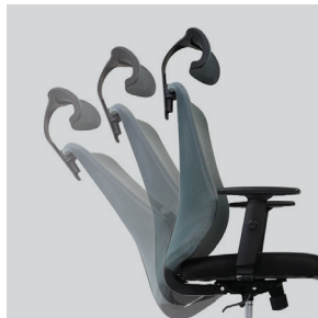
Adjustable backrest 20° backrest tilt angle, self-loaded three position locking